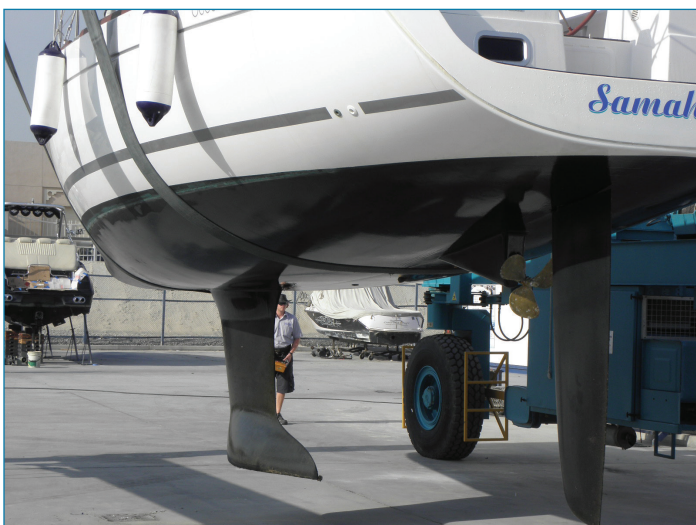
The bottom of the Beneteau Oceanis 37 is complete fouling free after two years in the water