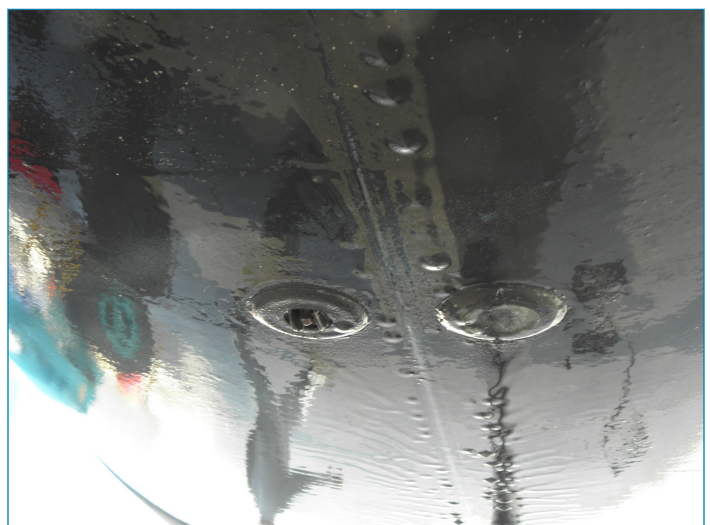
Close up of the hull after spending two years in the water